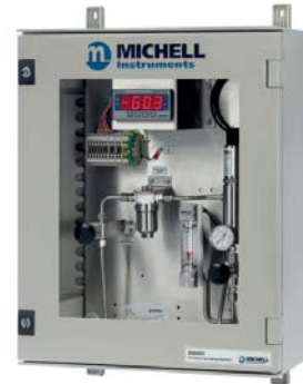
Hygrometer Sampling System

Michell offers a broad range of sensors with associated display and sampling systems for dew-point measurement applications, from trace moisture measurements, to compressed air quality ranges class 1 to 6 — meeting the needs of a broad range of industrial and process industries.